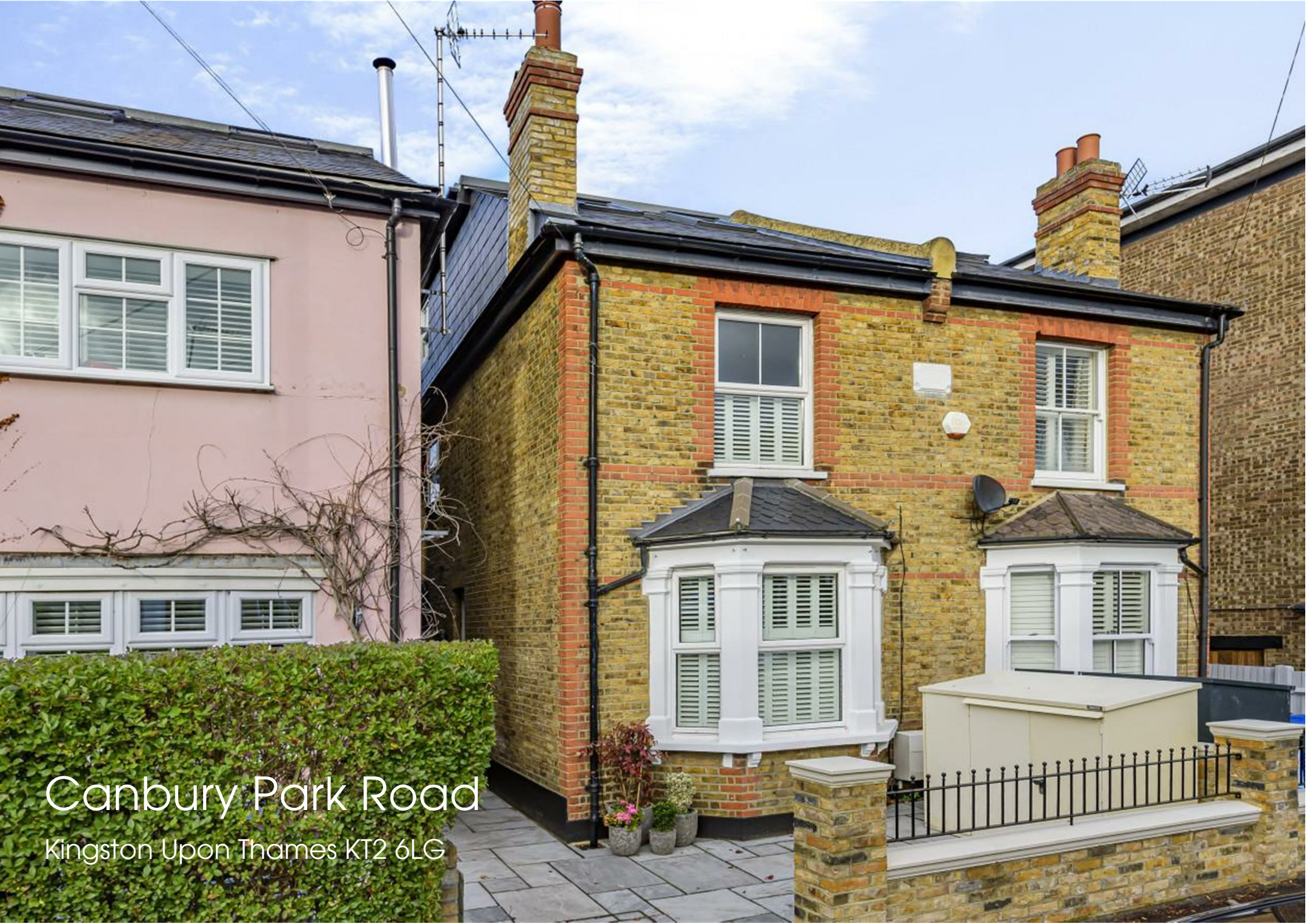
Canbury Park Road Kingston Upon Thames KT2 6LG

34 Richmond Road Kingston upon Thames Surrey KT2 6ED www.gibsonlane.co.uk Tel: 020 8546 5444